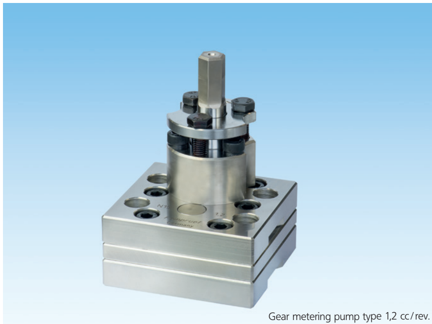
Gear metering pump type 1,2 cc/rev.