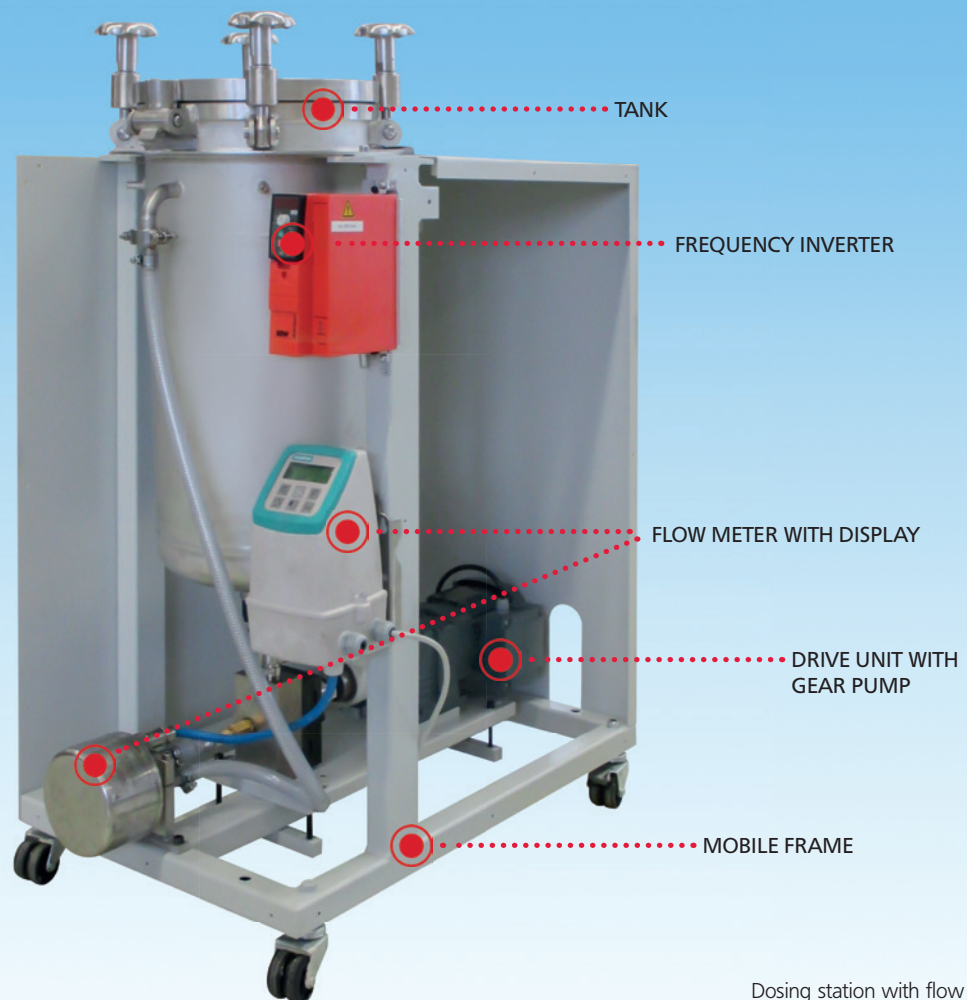
Dosing station with flow control