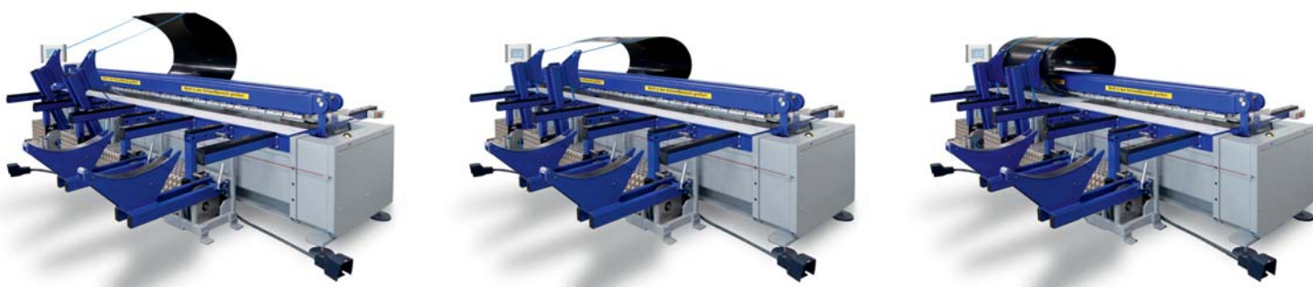
SM 440 with Sheet Rolling Device

The WEGENER sheet rolling technology allows the rational production of cylinders from thermoplastic panel materials. It has been designed as an option for the butt welding machines in the SM series and is available in two different power classes. It can be retrofitted on a WEGENER butt welding machine from the latest SM series at any time.