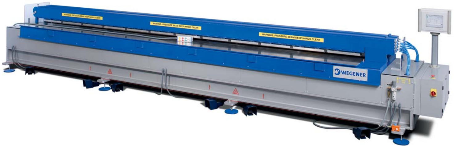
Butt Welding Machine with 6 m working width

Our butt welding machines from the SM series are based on a sturdy welded tube design and have been setting the standard for butt welding thermoplastic materials for decades. All of the machine's components are matched to the relevant load case to ensure the top quality welding of plastics. The machine tables are of a sandwich design to guarantee a high flexural strength. Together with the symmetrical design and the heavy-duty guides that are used, this results in a balanced load characteristic and ensures a constant quality of the welds, even when the available engine powers are in permanent use. The high quality standard of WEGENER -machines is your guarantee for maximum precision, reliability and longevity. You will find the right machine configuration to meet your needs from our range of butt welders, be this for the single-part or serial production of panel thicknesses from 3 - 60 mm, in working widths of 2 to 6 m. WEGENER butt welding machines for thermoplastic materials – are the original that has often been copied, but never matched.