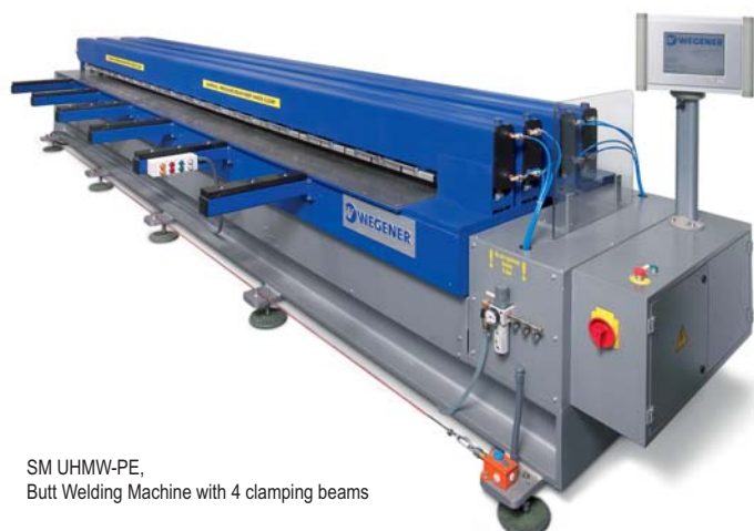
SM UHMW-PE, Butt Welding Machine with 4 clamping beams