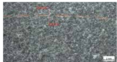
Laser weakening of genuine leather