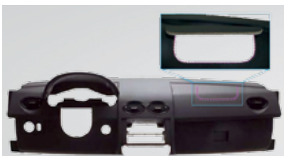
Instrument panel with laser scored flap

The JENOPTIK – VOTAN® A Scan scanner based system offers a new technological concept. The high speed beam control by scanner enables the multi cycle operation to reduce the heat impact to sensitive materials and increase laser usage efficiency. Multi sensor control assures top scoring quality at low cost of ownership.