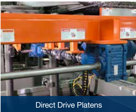
Direct Drive Platens