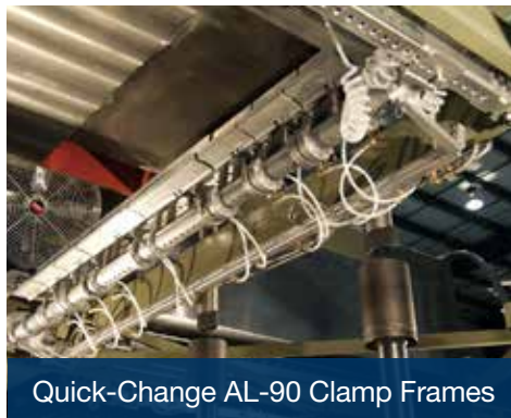
Quick-Change AL-90 Clamp Frames